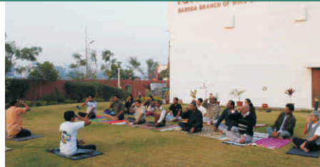
Workshop for Healthy Mind & Body on 26.01.2012