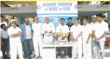
Cricket Match on 28.01.2012