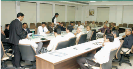
Past Chairmen Meeting on 21.01.2012