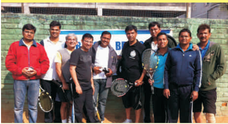
Tennis Match on 29.01.2012