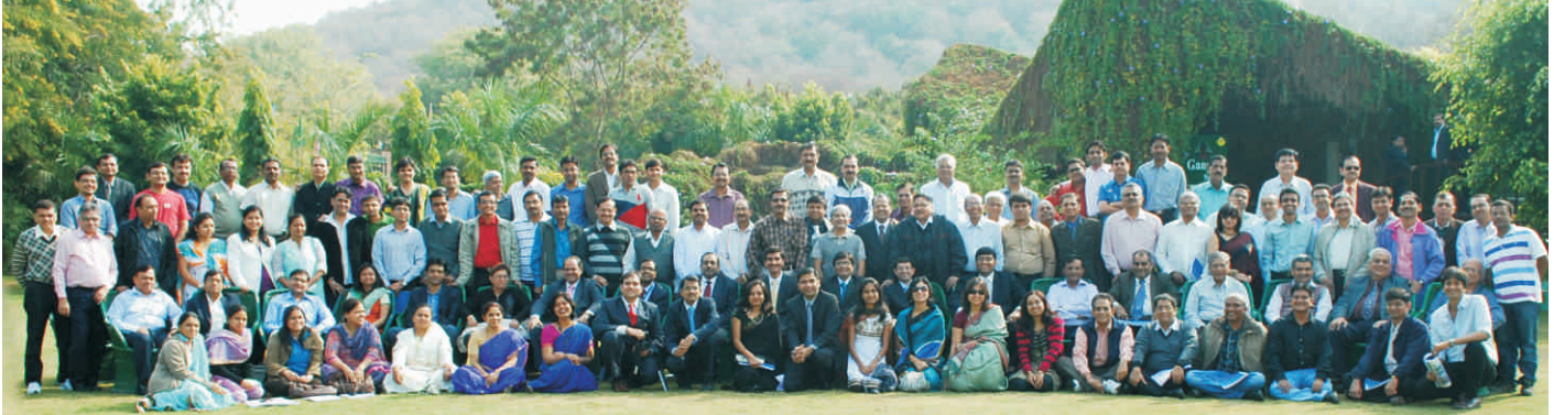
21st RRC Group Photo